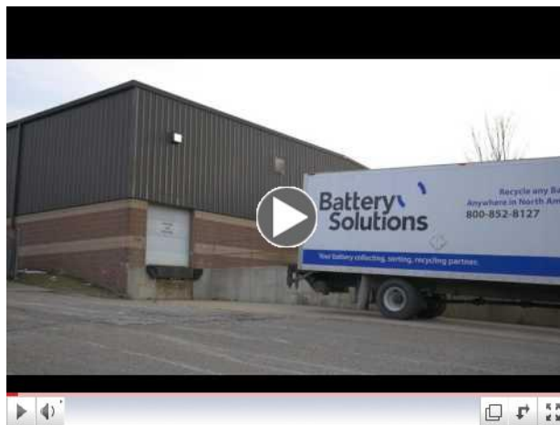
Watch this short video on battery recycling.

231-941-5555 | recyclesmart@grandtraverse.org | www.recyclesmart.info